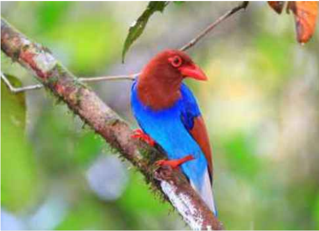
Sri Lanka blue magpie ( Urocissa ornata ), endemic to Sri Lanka (EBA).