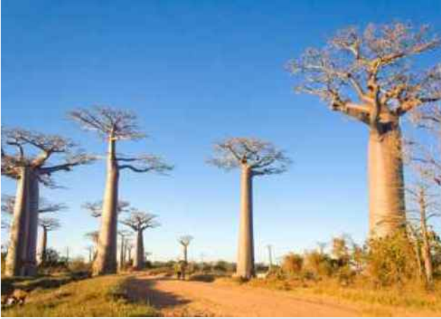
Grandidier's baobabs ( Adansonia grandidieri) in the Madagascar dry forest ecoregion.