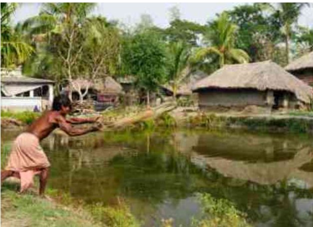
Fisherman in the Sunderbans Biosphere Reserve of the Ganges Delta, India.