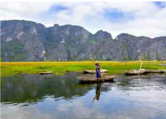
Van Long Nature Reserve (ICCA), Viet Nam.