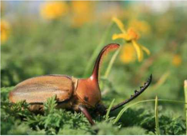
Rhinoceros beetle ( Golofa sp.), Ecuador, one of the megadiverse countries.