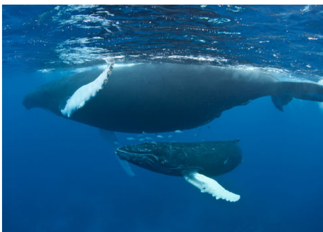
The humpback whale ( Megaptera novaeangliae ), a migratory species.