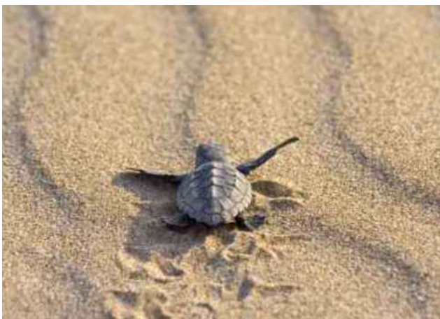
Baby loggerhead turtle ( Caretta caretta ) on beach.